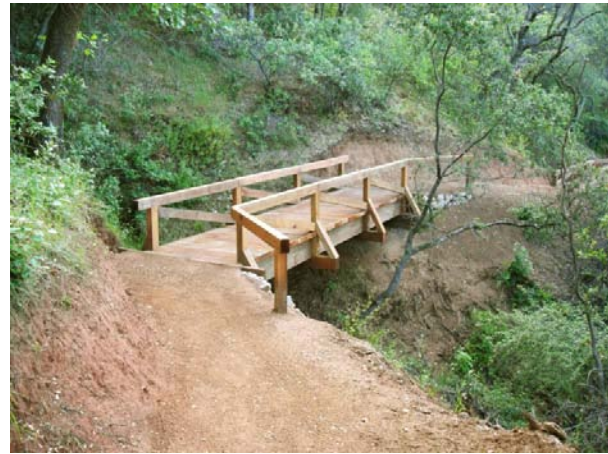
View along the out-sloped Pioneer Express Trail near Milepost 47 and a new timber bridge.