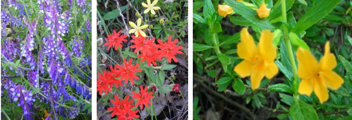
Wildflowers along the trail: Purple vetch, red & yellow aster, and yellow sticky-monkey.

Springtime is a splendid opportunity for horseback riding amidst the wildflowers at Avery's Pond, located about 1.2 miles north of the Rattlesnake Bar Equestrian Assembly Area, at Milepost 47.5 of the historic Pioneer Express Trail. LBHA riders will enjoy scenic views of the full reservoir of Folsom Lake along the North Fork of the American River.